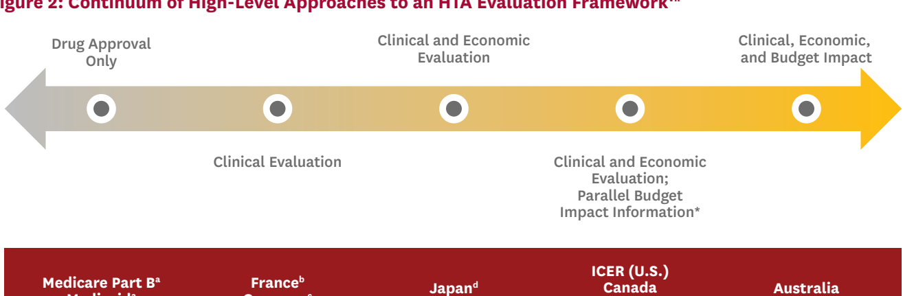
Figure 2: Continuum of High-Level Approaches to an HTA Evaluation Framework vii